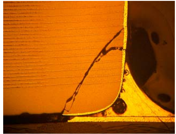
Fail Open Design

Since cracks never cross opposing electrodes, there is no chance of the crack causing a short.